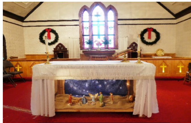
St. Johns Christmas Eve