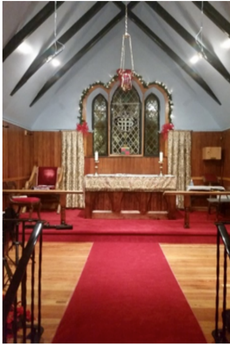
St. Stephens Christmas Eve